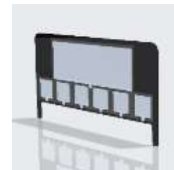
Exchangeable brand merchandizer 91 x 297mm Exchangeable product labels 45 x 45mm