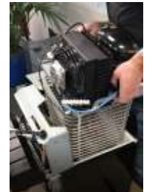
Removable refrigeration deck system